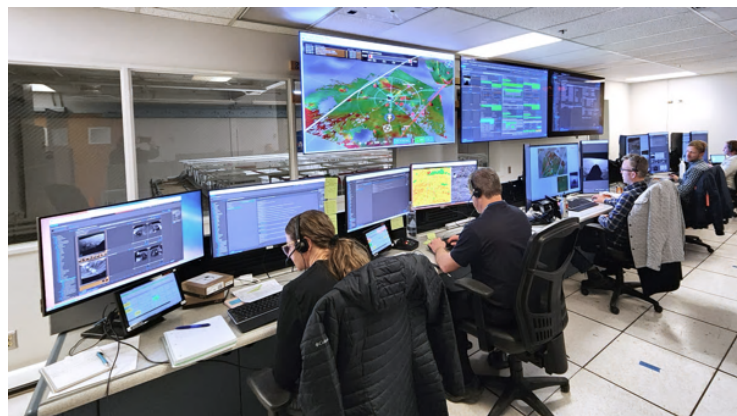
Fig. 4: Inside the VIPER Mission Operations Center, a view of the front row consoles supporting the roles of (from left to right) Science Lead, Real-time Science, Rover Driver, Co-Driver, Navigation.

The science operations system for the VST in the MSC includes a specific set of protocols for two-way communication with the Real-time Science in the MOC. VIPER's Science Operations workgroup examined the workload that this represented for the Real-time Scientist and determined that two science roles were needed in the MOC [18]. Figure 4 shows the role of Science Lead seated next to the Real-time Science role. The role of Science Lead was developed to support mission science activities in the MOC, working in collaboratively with the scientist in the Real-time Science role and the scientists in the MSC. Real-time Science role was thus enabled to maintain attention and participation with the drive team without risk of losing contact with their science team counterparts.