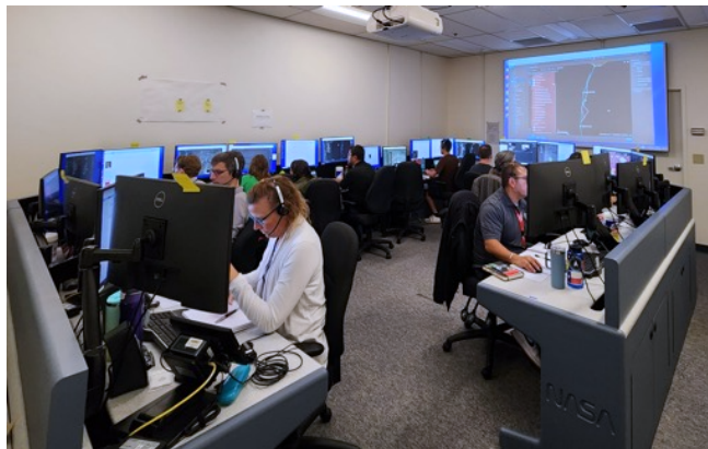
Fig. 3: VIPER scientists seated at twelve assigned console positions in the MSC.

The Real-time Scientist needs to draw not only from their own knowledge but also from that of their co-investigators, the scientists that are seated in the MSC, see figure 3, in an adjacent building within ARC's Multi-Mission Operations Center (MMOC). Together, the VST provide mission-enhancing scientific input to guide traverse planning and drill site confirmation/selection throughout surface operations. Their input is of vital importance to the mission's ability to maximize science return and to meet broader objectives for future lunar ISRU and exploration activities. The VST would enable the characterization of the distribution (lateral and vertical extent, concentration, variability), form (chemical/physical state of these reservoirs of lunar water and key isotopes), and context (e.g., accessibility/overburden environment, soil mechanics, trafficability, and temperatures) of lunar polar volatiles and water content for the VIPER mission. During surface operations, the VST would be enabled to provide science-driven, consensus-based, timely input and decision-making to enhance mission operations and mission science return [17].